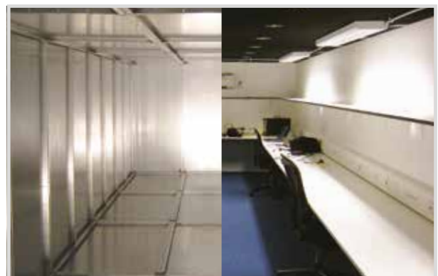
Left without interior finish

The modular panels can be shipped and assembled by the customer or under supervision of our engineers, anywhere in the world.