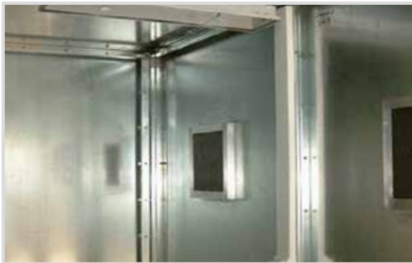
Mounted lighting, busbars, etc. inside the cage

Versions for direct attachment of ferrite, and RF pyramidal absorbers can also be supplied to create an echo-free (anechoic) test chamber.