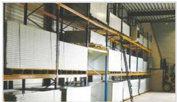
Prefab Faraday cage stock

These custom sizes can be produced in several weeks from order date. When desired, the Faraday cage can also be adjusted on location.