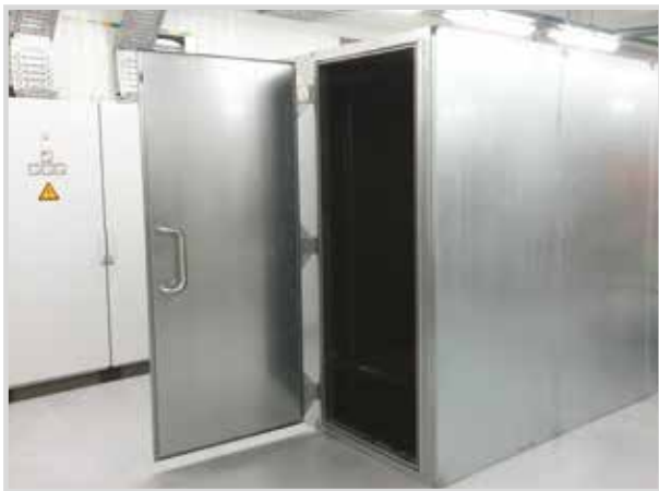
Prefabricated Faraday cage with swing door

A freestanding (independent of the host building) prefabricated modular Faraday cage provides a superior screening of RF-signals and is applicable in a wide range of situations for a wide range of purposes as described below. The modular Faraday cage is designed to meet or even exceed the vast majority of shielding requirements requested in today's society.