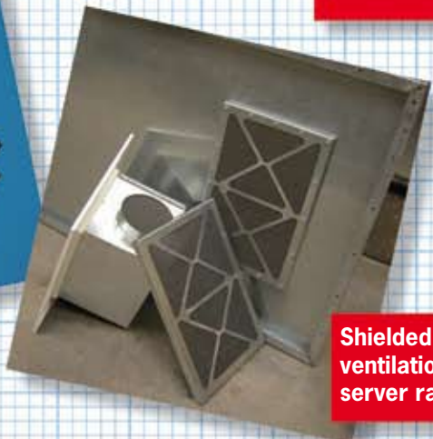
Shielded ventilation for server racks