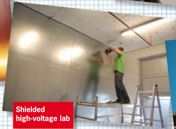
Shielded high-voltage lab