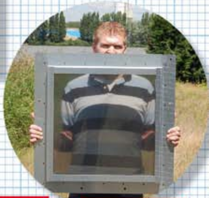
Ultra high shielded window