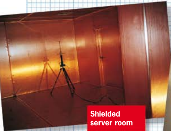
Shielded server room