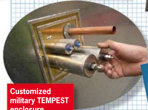
Customized military TEMPEST enclosure