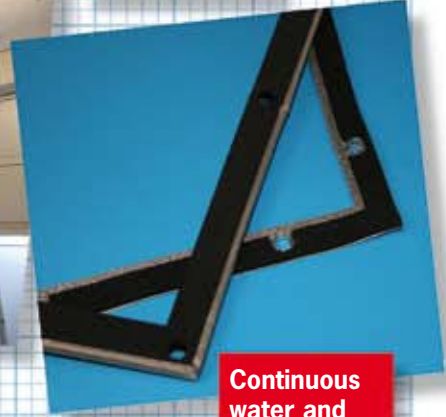
Continuous water and EMI seal