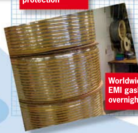
Worldwide EMI gaskets overnight delivery