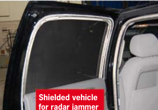
Shielded vehicle for radar jammer protection