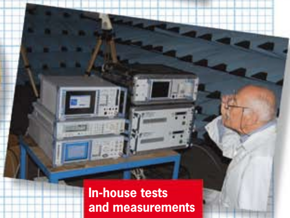
In-house tests and measurements