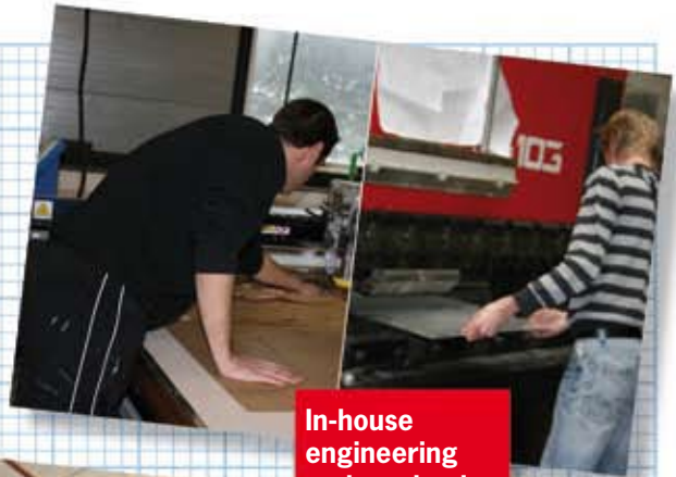
In-house engineering and production

Our own European production facility in The Netherlands allows us to meet any challenge in providing Electromagnetic solutions for the medical, space and defense industries. This way we help our customers meeting specific EMC, CE, FCC, TEMPEST and MIL-STD standards for enclosures and gaskets.