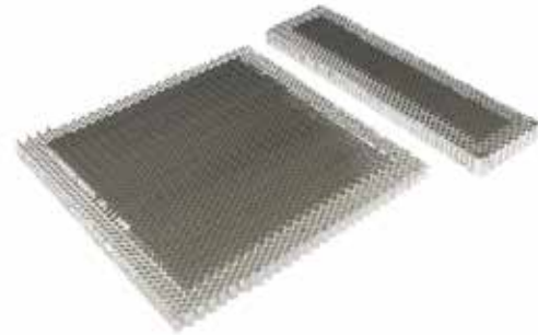
Frameless EMI shielding ventilation panels can be made with compressed sides

Honeycomb vents are used to EMI shield openings for ventilation or acoustic/visual contact. We can make these vents according to your drawing within a few days, or you can use our standard range from stock.