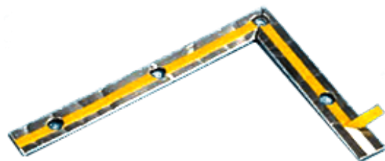
8101 Frame gasket; Amucor version with neoprene core. Holes according to customer's drawing and conductive self-adhesive