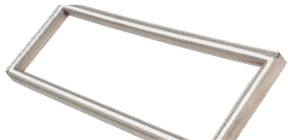
8100 Frame gasket; conductive textile version with self-adhesive on the back