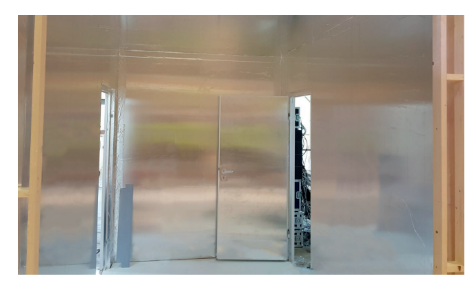
Big amucor cage for drone testing